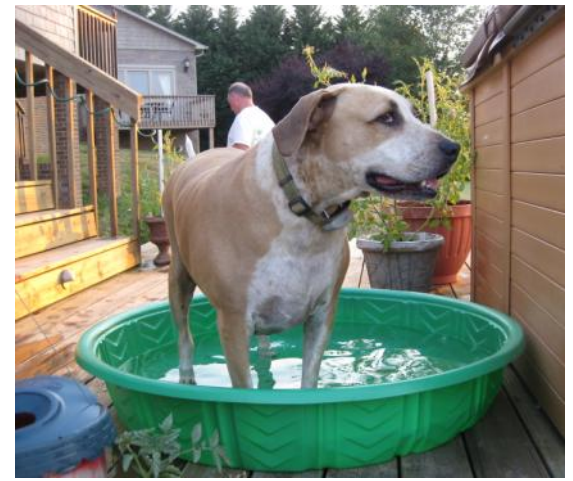
Our dog "Freckles" trying to beat the heat in his pool. Don't forget your animals during this hot, dry summer. They need to stay cool too!

how much do you need to budget, not just for the cost of the pool but for the maintenance supplies that will be needed?